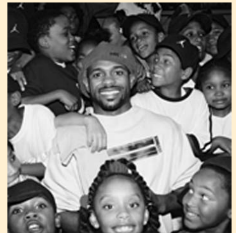
Welcome to SEI Roy! Undisputed Light Heavyweight Champion of the World, Roy Jones, Jr. shared his passion and inspiration with SEI students during a recent visit to The Center for Self Enhancement.